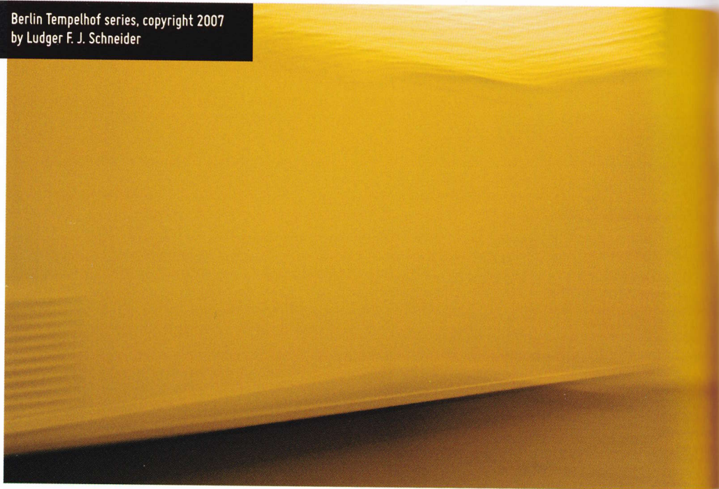
Berlin Tempelhof series, copyright 2007 by Ludger F. J. Schneider

The series entitled ZeitRaum (Time-Space, also translatable as Space-Time) possibly suggests experiments in chrono-photography and photo-dynamism, but is distinguished from these by its poetic quality. These are not coldly sectioned stages of movement, and not intervals between one shot and another secured with a